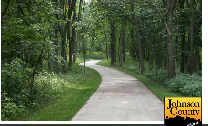
<u>3196 Half Moon Ave NW</u> <u>Tiffin, IA 52340</u>